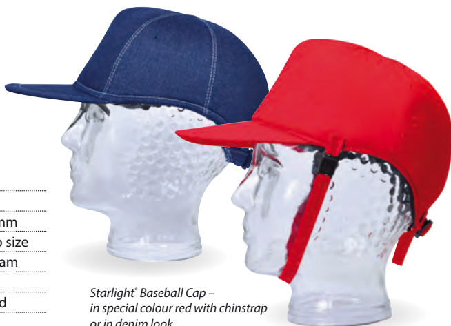
Starlight® Baseball Cap – in special colour red with chinstrap or in denim look