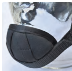
Chin protection (accessory)