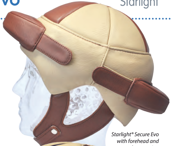
Starlight® Secure Evo with forehead and neck protection in various colour (option)