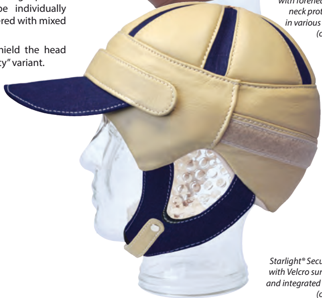
Starlight® Secure Evo with Velcro sunshield and integrated denim (option)