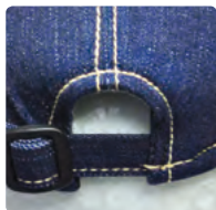
Starlight® Generation – Width adjustment