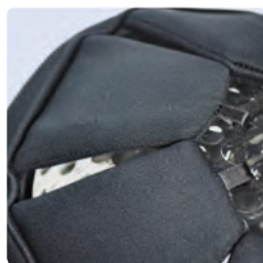
Individuell verstellbare Trapetzpolster

The cleaning of the head protection is also no problem by hand washing up to 30°.