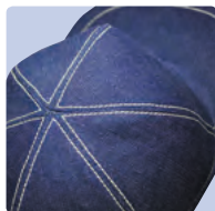
Starlight® Generation – Colour contrasted seam stitching in denim look.