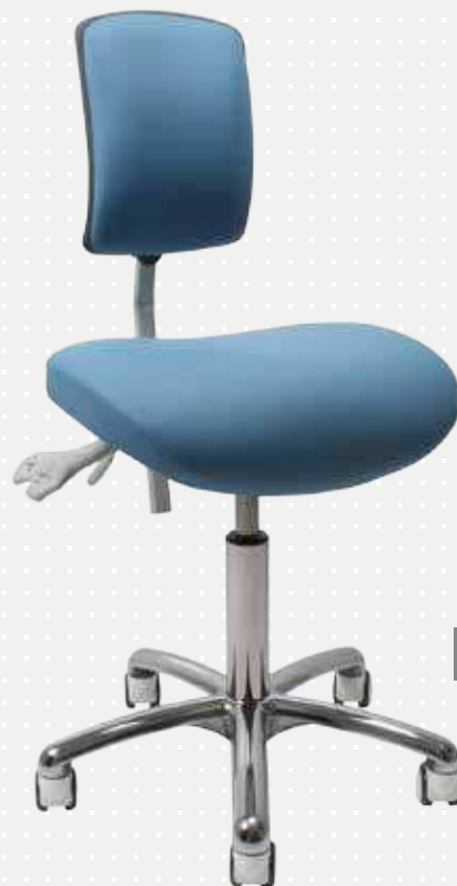
VELA Samba 150