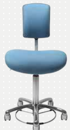
VELA Samba 150