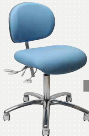
VELA Latin 100