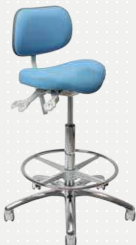
VELA Samba 110