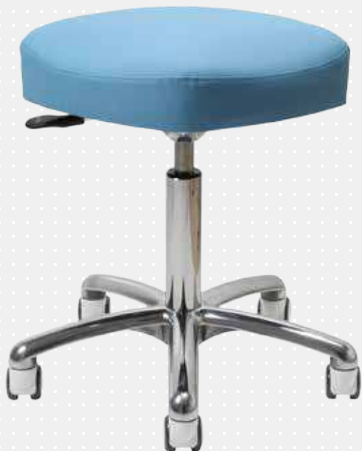
VELA Samba 410

VELA Samba 410 is a unique chair that allows movement in the lumbar spine through the uniquely-designed seat.