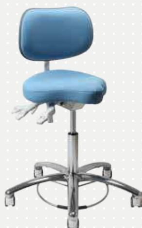
VELA Samba 120