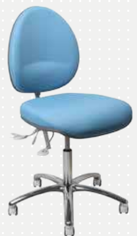
VELA Latin 200