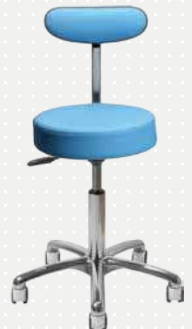
VELA Samba 510