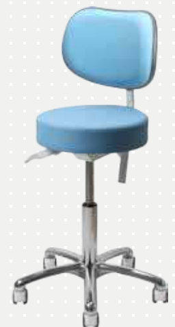
VELA Samba 520