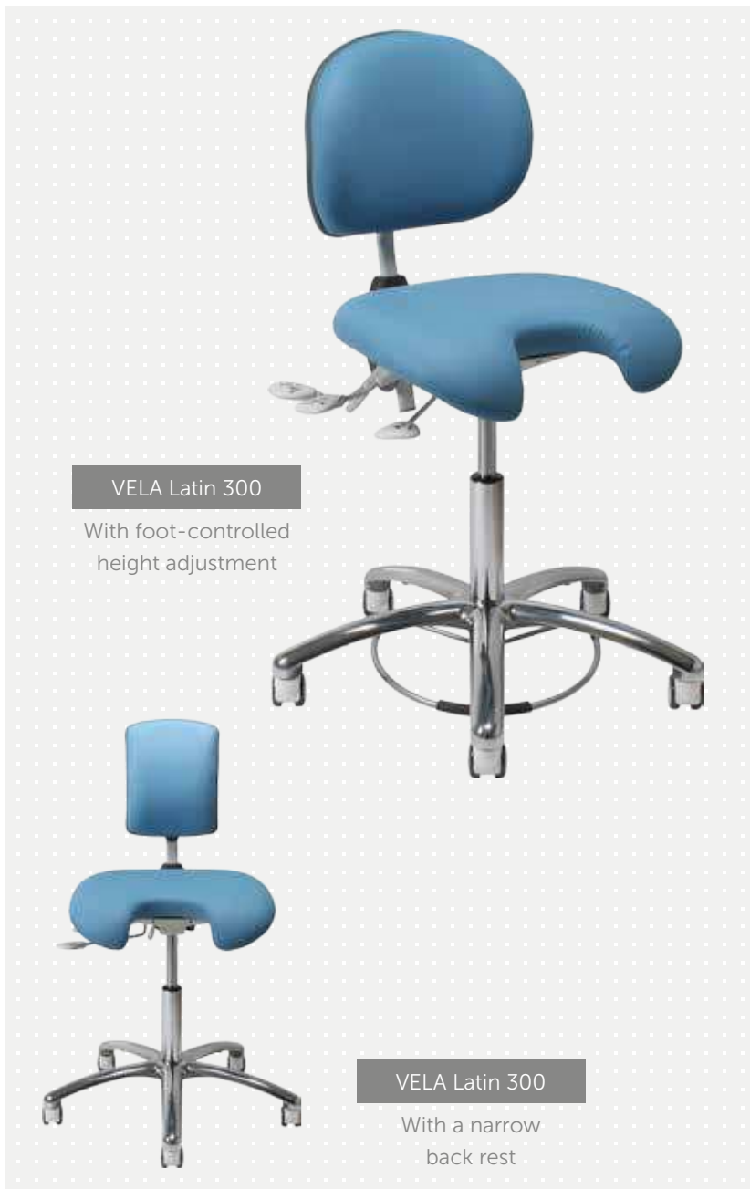
VELA Latin 300