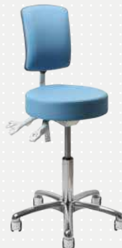
VELA Samba 520