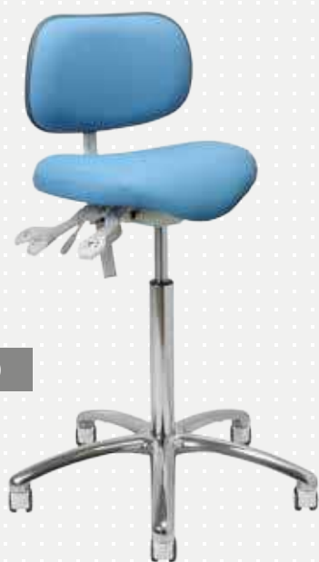
VELA Samba 100