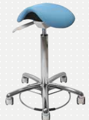
VELA Samba 400

with a narrow, ergonomic curved back rest