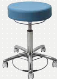
VELA Samba 500