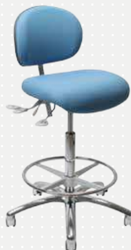
VELA Latin 100