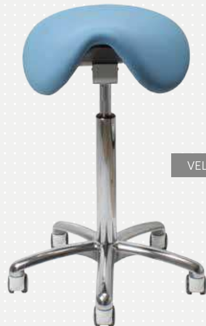
VELA Samba 400