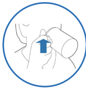
Tilt with mouth