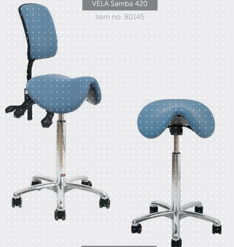
VELA Samba 420