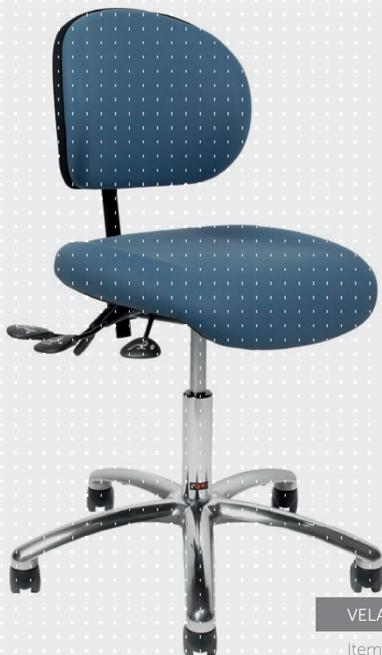
VELA Latin 100