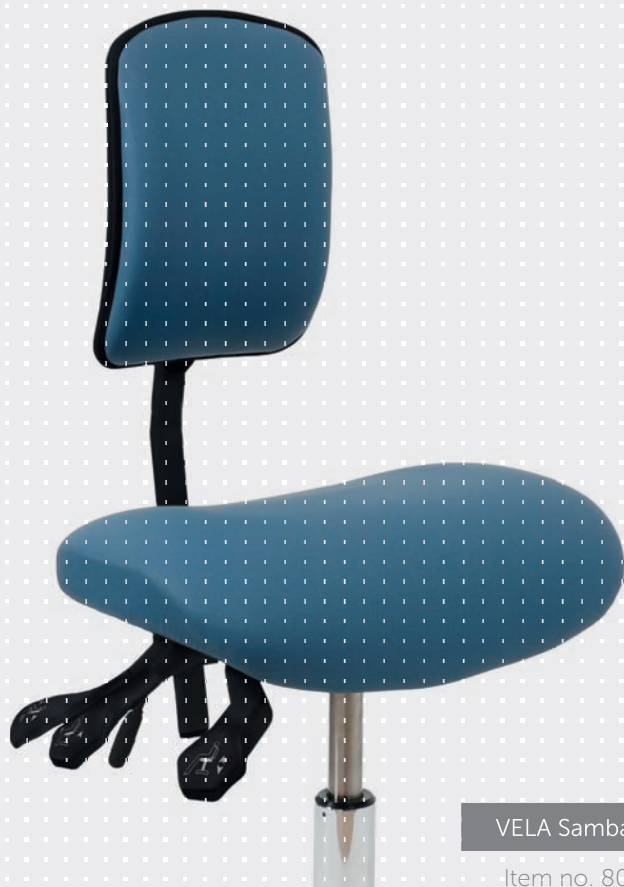
VELA Samba 150