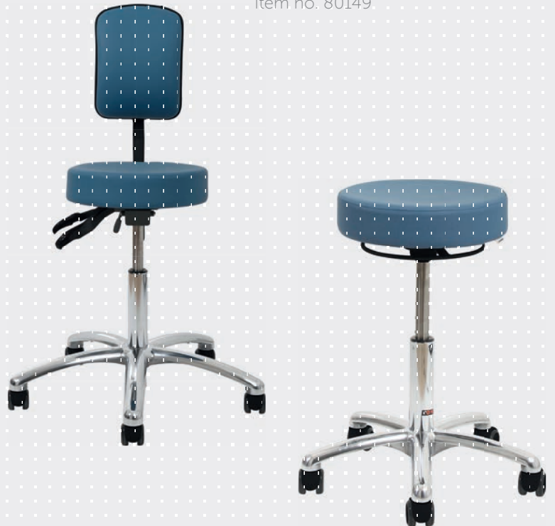
VELA Samba 500